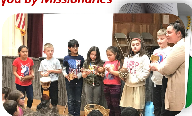
St. Charles Borromeo PREP in Bensalem

Invite a local Missionary to your school & bring to life the imagination of your students hearing personal testimony of what it means to be a Missionary in prayer and service of others. The MCA office collaborates with many local Missionaries from around the world who are happy to share their experience with your students.