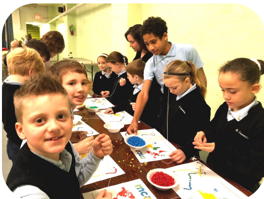
Saint Laurentius in Philadelphia