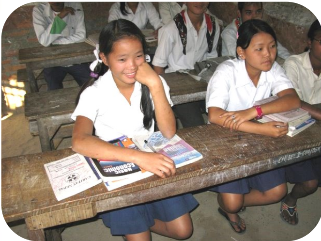
Two High School students at their "desks" learning in Bhutan, a landlocked country in East Asia