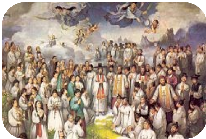
A picture commemorating the Korean Martyrs

Three years later, he was ordained and embarked on a five-month journey to Korea. After language training, Pierre lived for a month with Bishop Simeon Berneux. Pierre was ready to accomplish his dream and be sent out as a Missionary! Since persecutions were underway, Pierre disguised himself in Korean garb. He was an untiring servant of his people. "This little priest is working little miracles and excellently teaching his people devotion to the Eucharist and Mary," Bishop Berneux wrote.