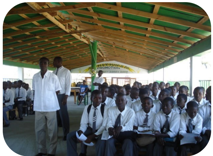
Teachers and Students at Free High School in Cite Soleil, Haiti shown here below

In our Resources, you will find activities for various ages and school levels; pre-school, elementary, special education and even secondary schools and High Schools!