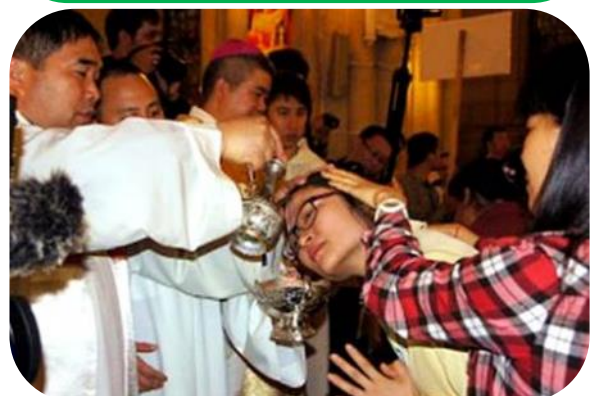
A young girl being baptized in China