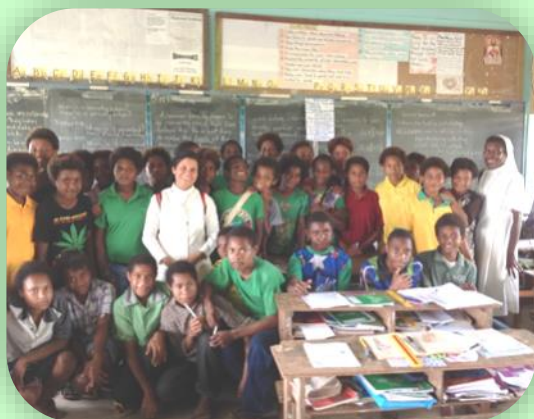
Children at a School in Papua New Guinea

Today we gather to celebrate in thanksgiving for all Catholic Schools. We remember Jesus' promise that the Holy Spirit will be with us in all that we do and pray that He guides us in our call to be Missionary Disciples . Through the sacrifices of Missionary Childhood Members, children in Missions around the globe receive a Catholic education and learn about the Good News of Jesus. Missionary Childhood members support 1,200 Catholic schools, over 10,000 orphanages and catechetical programs in 1,111 Mission Dioceses.