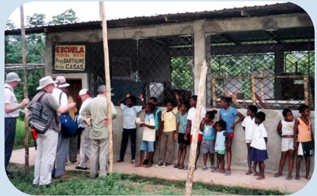
School in Esmeraldas, Ecuador built with donations from MCA members

This month, leading up to CATHOLIC SCHOOLS WEEK, remember the MANY Schools in Mission lands that need our Prayers and Sacrifices so they can learn like we do in our Catholic Schools and Religious Education Programs.