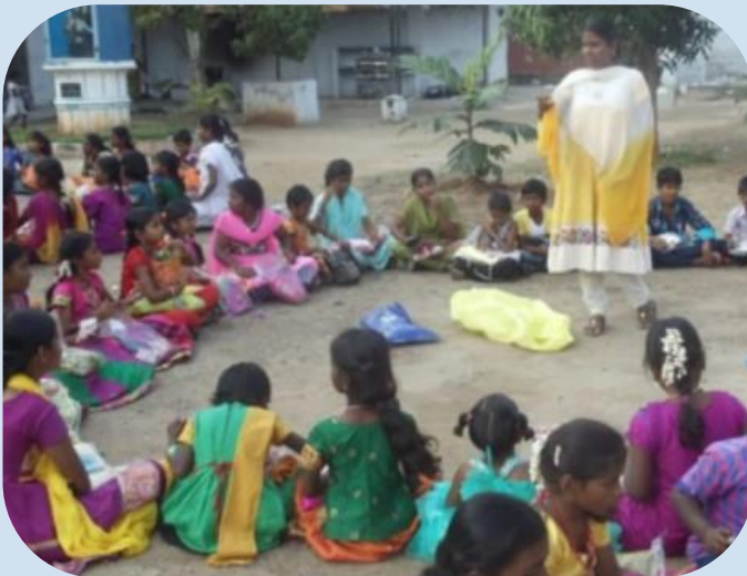
Salesian School Chennai, India

In the Missions there are children who don't even have a school to attend. Other places, they may have a building and nothing else. Here are some photos for your prayer corner, showing Schools in the Missions that need our help.