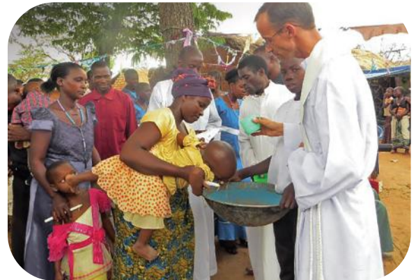
A child being baptized in Tanzania, Africa

Begin the Year with a heart that is courageous in helping the Mission of the Church.