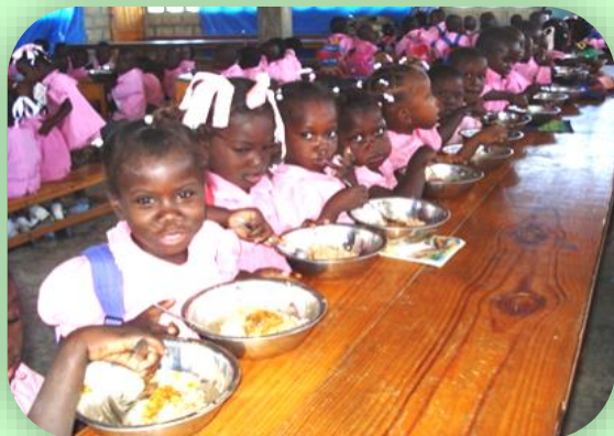
Children eating rice and beans at a school in Haiti

ALL: May we inspire others to support the Missions through prayer and sacrifice.