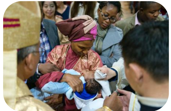
A baptism service in Mongolia, one of the newest Dioceses in the world

Help Missionaries who are leading others to be baptized in the Missions!