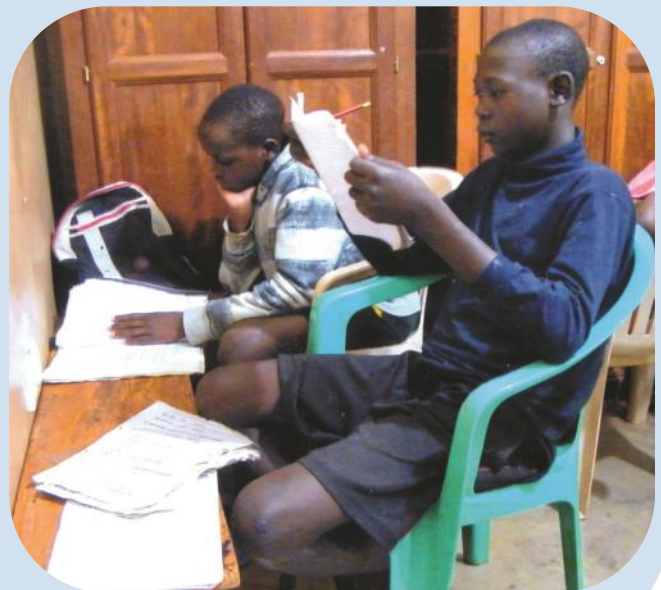
Young boys using a bench as a desk at a school in Uganda

In the Missions there are children who don't even have a school to attend. Other places, they may have a building and nothing else. Here are some photos for your prayer corner, showing Schools in the Missions that need our help.