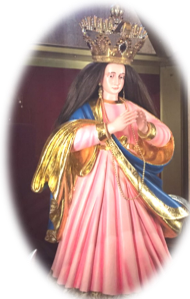
•Our Lady of Kamalen• Guam•Oceania