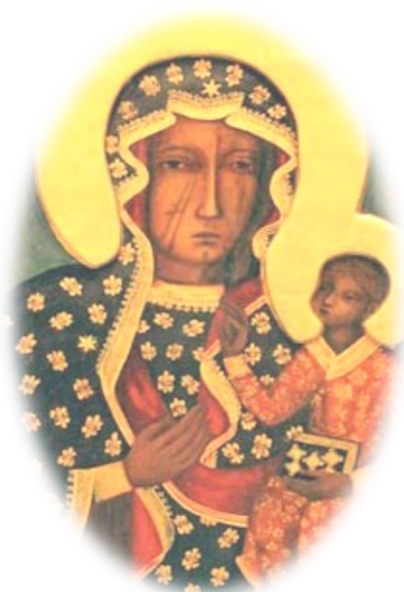
◦Our Lady of Czestochowa◦ Poland◦Europe

See the different portraits of Mary from mission areas of the World Mission Rosary, Pray one "Hail Mary" each week in May for each Mission area. World Mission Rosary.