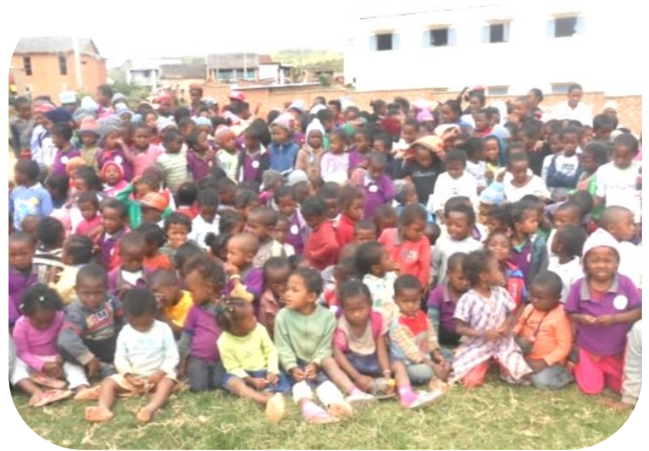
Sisters of St. John Orphanage in Madagascar