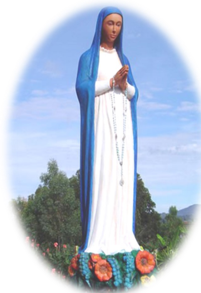
•Our Lady of Kibeho• Rwanda•Africa