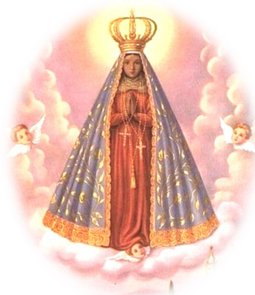
•Our Lady of Aparecida• Brazil•The Americas