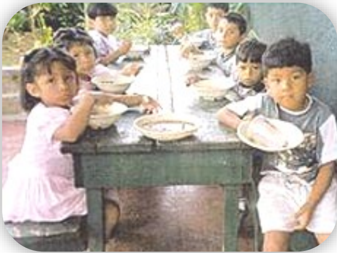
Orphans in Nicaragua

As we celebrate Mary in the month of May, especially pray for children in the Mission Lands who are living in orphanages. These children, without the love of their parents, need your prayers and sacrifices.