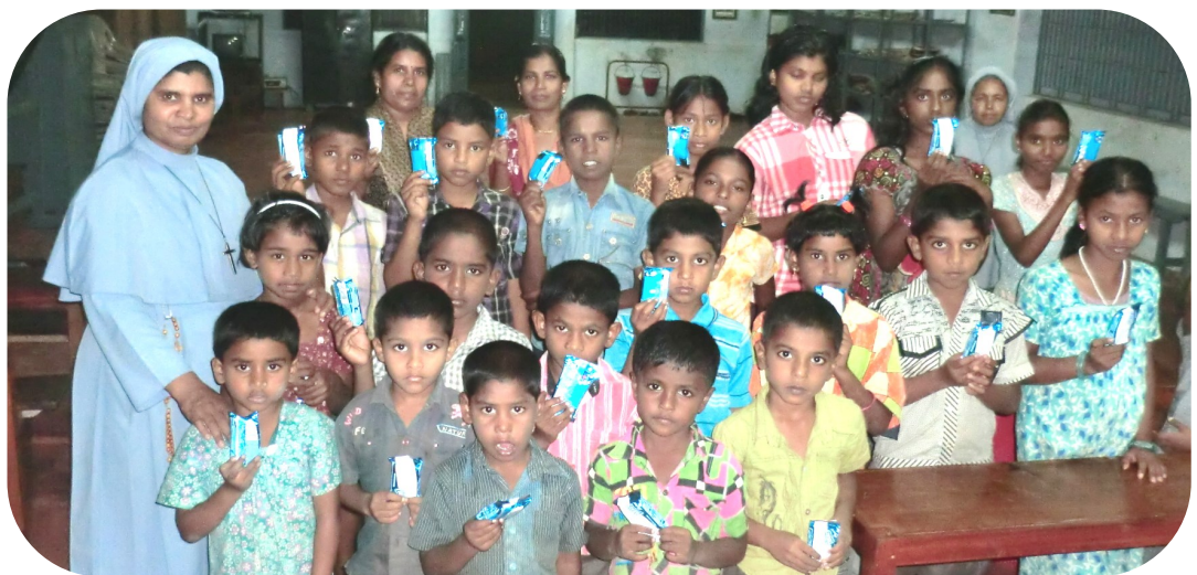
Saint Alphonsus Orphanage in India