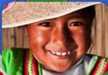
Young girl from Peru