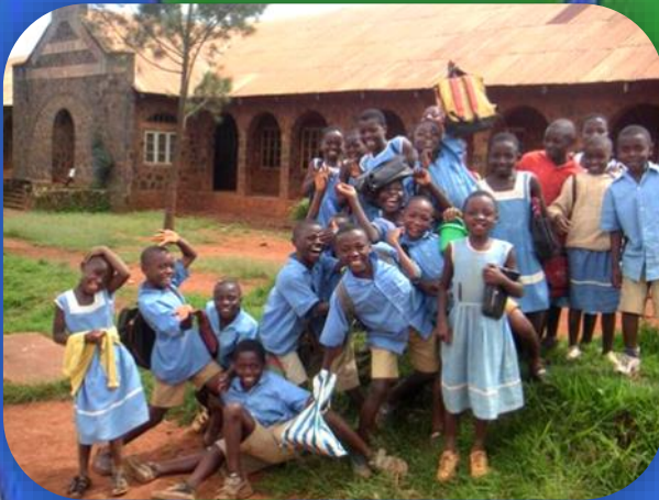
Happy School Children in Haiti