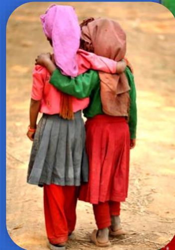
Two young children together in hope in Nepal