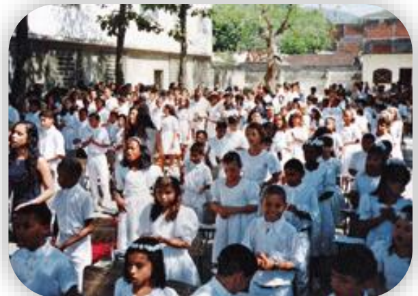
Children receiving their First Holy Communion