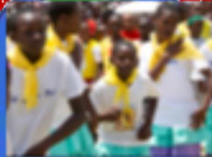
Children show their love for God at Mass through dance in Kenya.