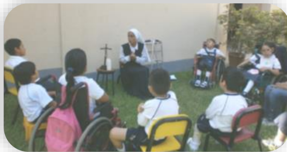
Children learning how to pray