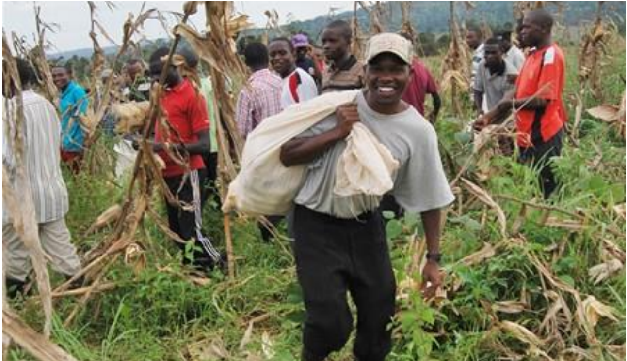
A Seminarian working in the field at the Saint Thomas Aquina Katigondo Seminary in Uganda, Africa

"No vocation is born of itself or lives for itself. A vocation flows from the heart of God and blossoms in the good soil of faithful people, in the experience of fraternal love." - Pope Francis