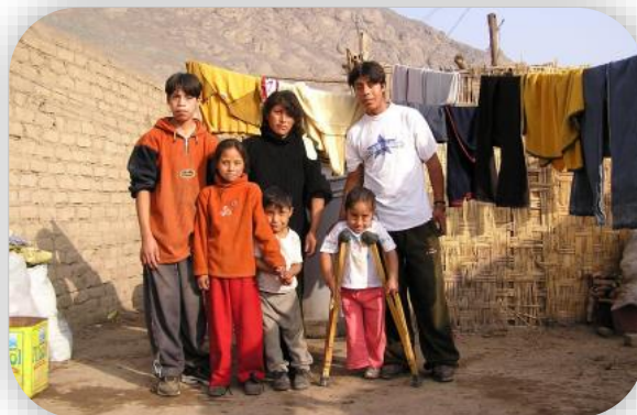
Many families that go to the Joy in the Lord Center live in homes in areas like this.

With a small sacrifice of a $1 , MCA children can help children who attend the Joy in the Lord School in Peru, and places like it in the world.