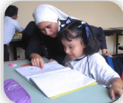
A Servant of the Plan of God Sister teaching a First grade student

Many of the families in Lima, Peru are suffering from poverty, and over 90% of these children require a scholarship in