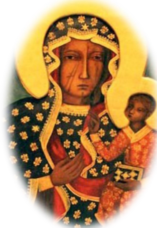
◦Our Lady of Czestochowa◦ Poland◦Europe

Throughout the world, people picture our Blessed Mother Mary differently. See the different portraits of Mary from mission areas of the World Mission Rosary, Pray one “Hail Mary” each week in Mary for each Mission area.