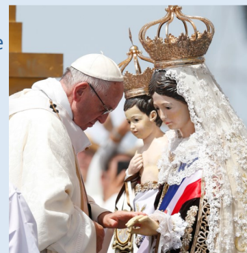
Pope in Lobito, Chile