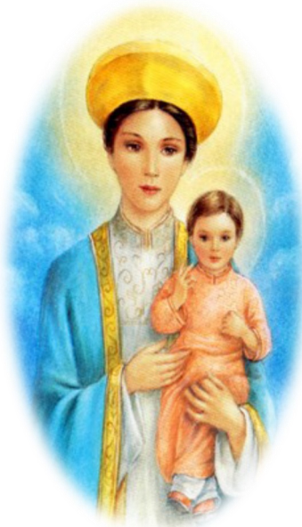
•Our Lady of La Vang• Vietnam•Asia