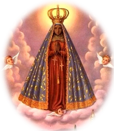
•Our Lady of Aparecida• Brazil•The Americas