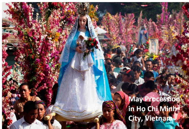
May Procession in Ho Chi Minh City, Vietnam