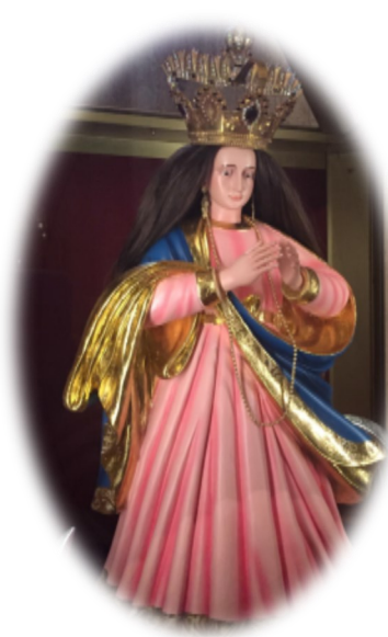
•Our Lady of Kamalen• Guam•Oceania