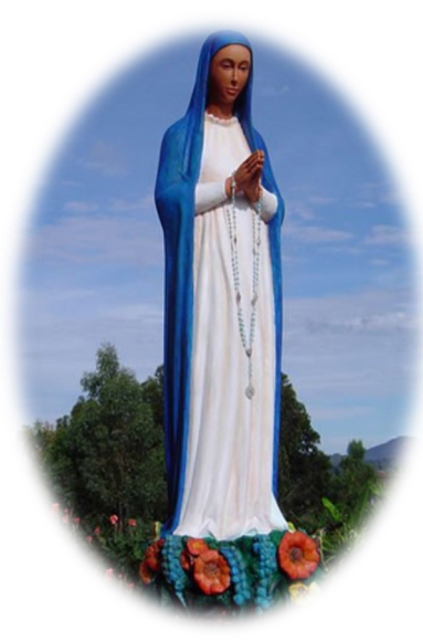
•Our Lady of Kibeho• Rwanda•Africa