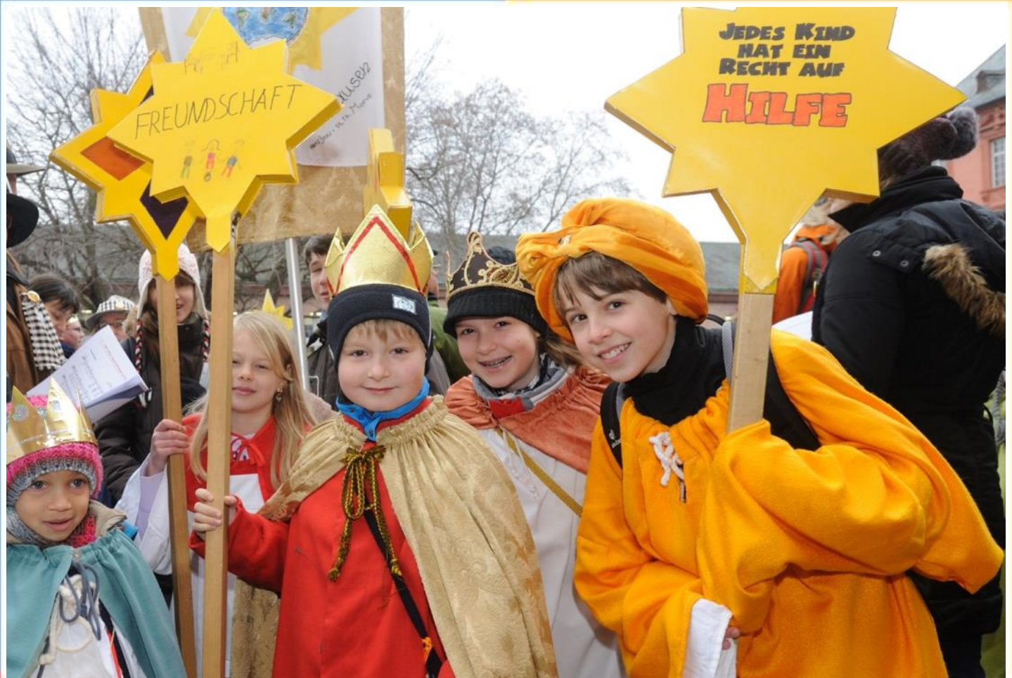
Star Singers of Germany pictured above

This year, as we celebrate the EXTRAORDINARY YEAR OF MISSION , Missionary Disciples throughout the Archdiocese of Philadelphia became " Children helping Children " through their prayers and the sacrifices they made for children in Mission lands. They aren't alone, together, they join thousands of children all over the world, who are committed to helping others in most need.