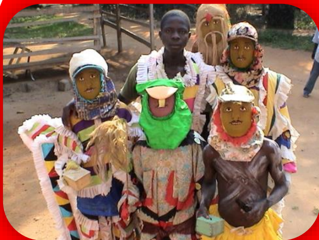
Christmas Play in Ghana, Africa

All over the world, children are celebrating the Birth of Jesus!