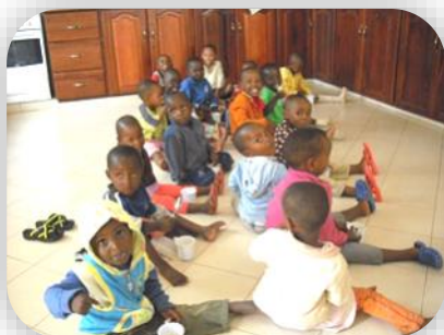
Children meeting for the first time!

Responding to God, on the 50th Anniversary of their founding, the Holy Spirit Sisters opened the Sun of Hope Village Orphanage. The Sun in the orphanage's name has come to represent another day in the lives of each of these children.