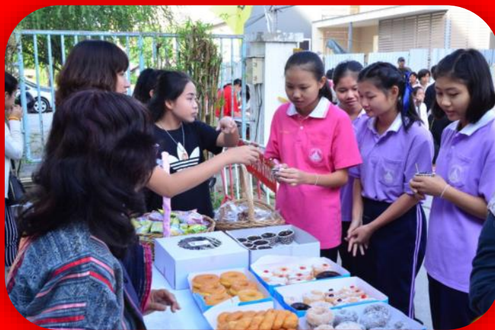
Children receiving a Christmas Snack at an Orphanage in India

“For God so loved the world that He gave His only Son, so that everyone who believes in Him might not perish, but might have eternal life.”