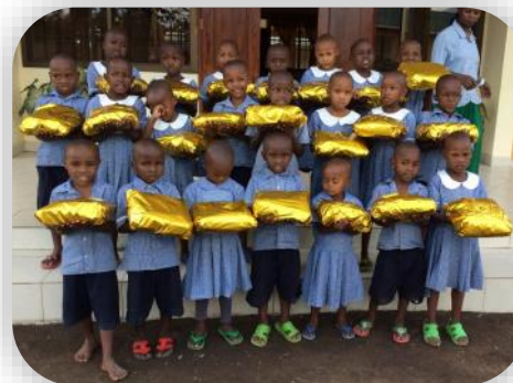
Each child received a Christmas gift, they were so happy!