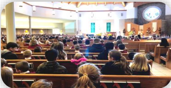
Mission Presentation at Pope John Paull II Regional School in West, Brandywine