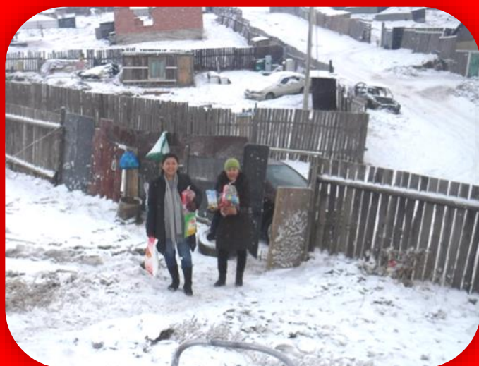
Delivering Christmas Gifts in Mongolia

“For God so loved the world that He gave His only Son, so that everyone who believes in Him might not perish, but might have eternal life.”