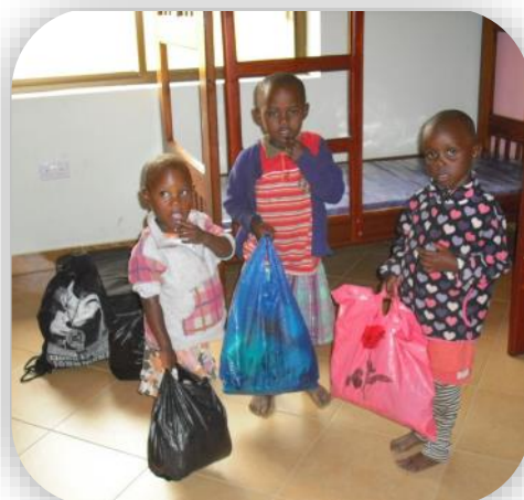
Children arriving at Sun of Hope

Pray and sacrifice for children like those in Moshi, Tanzania and around the World. The children at Sun of Hope are being taught to pray the World Mission Rosary, just like you! To the left is a photo of the children praying.