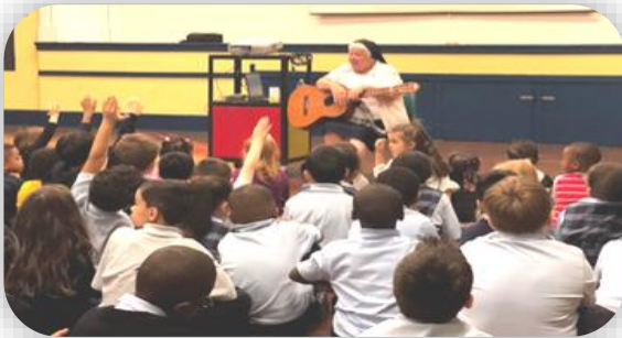
Presentation BVM School in Cheltenham

Have you scheduled your annual MCA Mission Presentation? Schools around the Archdiocese have been actively praying and sacrificing for the Missions. Contact the MCA office today, it is not too late to have a Missionary visit during the season of Advent!