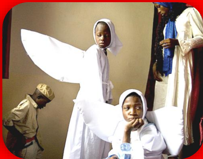
Children preparing for a Christmas Nativity Play in the Dominican Republic