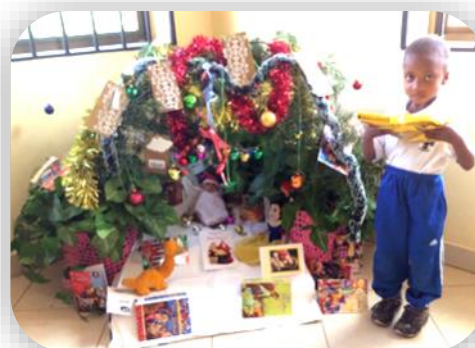
Together, the Children made a home-made Christmas Tree