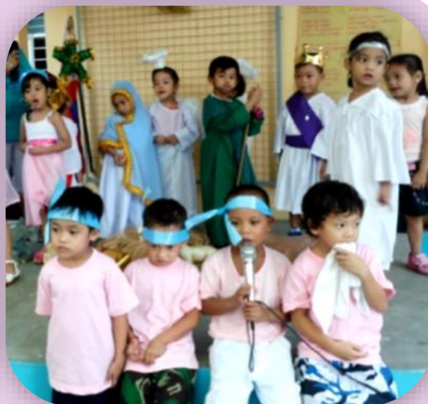
Advent Pageant in Manila, Philippines