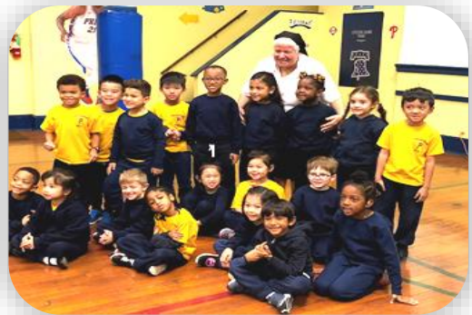
Kindergarten Class at Presentation BVM