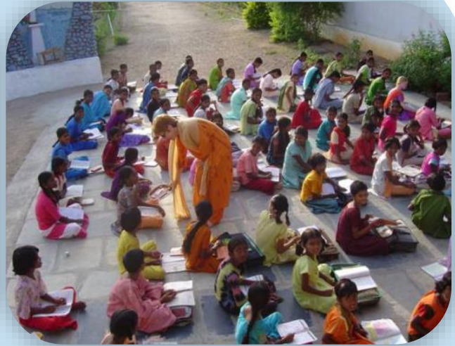
School in Guyana, India