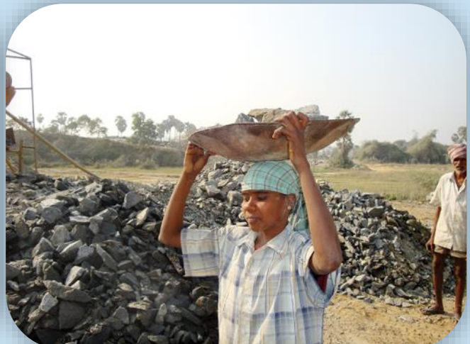
Children whose parents can't afford to send them to school work in the Quarry in this small village in India