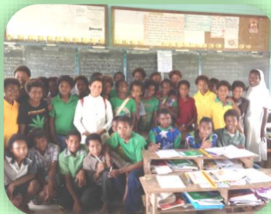
Children at a School in Papua New Guinea

Today we gather to celebrate in thanksgiving for all Catholic Schools. We remember Jesus' promise that the Holy Spirit will be with us in all that we do and pray that He guides us in our call to be Missionary Disciples . Through the sacrifices of MCA members, children in Missions around the world receive a Catholic education and learn about the Good News of Jesus. MCA members support 1,200 Catholic schools, over 10,000 orphanages and catechetical programs in 1,111 Mission Dioceses.