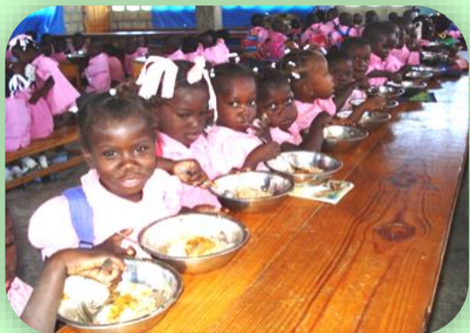
Children eating rice and beans at a school in Haiti

ALL: May we inspire others to support the Missions through prayer and sacrifice.