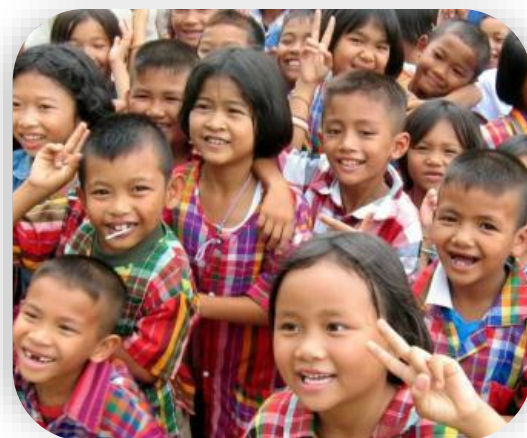
The children pictured above and below are dressed up for the last day of summer camp in one of the mausoleums in Cebu City, Philippines

The Philippines is a Southeast Asian country in the Western Pacific, comprising more than 7,000 islands