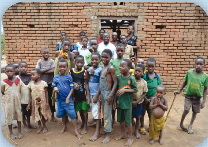
School age children in Malawi, Africa who need school supplies and uniforms to be able to go to school and receive an education