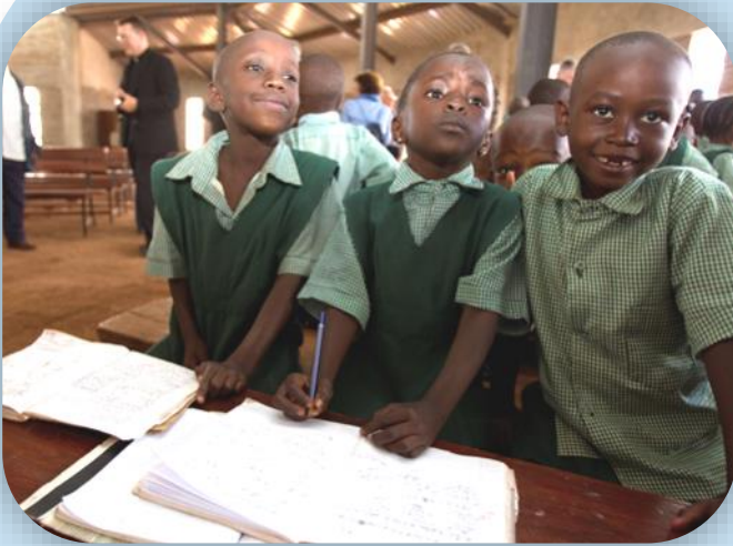
Kids writing at a school in Kibera, Africa