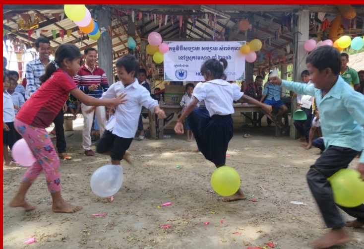
Playing games at a village-wide Christmas Celebration in Cambodia.