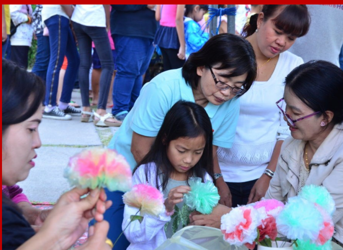
Making tulle flowers for a Christmas Festival in Vietnam.