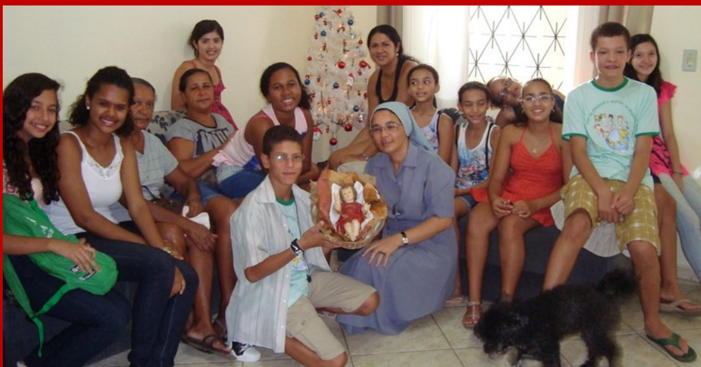
MCA Member in the parish of Nossa Senhora Aparecida in Zouk Mikael, Lebanon, prepare a welcome for Baby Jesus.