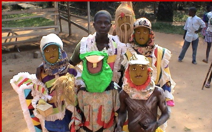
Children bring to life the birth of Jesus in Nativity plays in India and Africa.