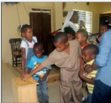
St. Robert Bellarmine Prep School MCA Children place their donations in the MCA Collection box

Here in the Mandeville Diocese, our children have been doing their part. Each year, the students in our nine basic schools and six prep schools have been participating in an annual Calendar Poster Competition. Thirteen winners are featured in the MCA Calendar which is published and sold to raise funds for the Association. The winners were also given prizes.